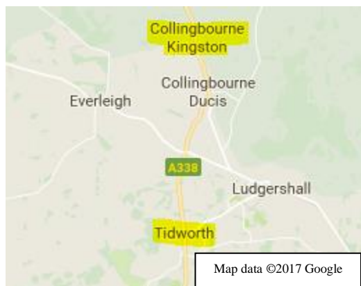
Collingbourne Kingston and North Tidworth

By 1801 the population of North Tidworth was only about 240 people, compared to Collinborne Kingston with about 731.