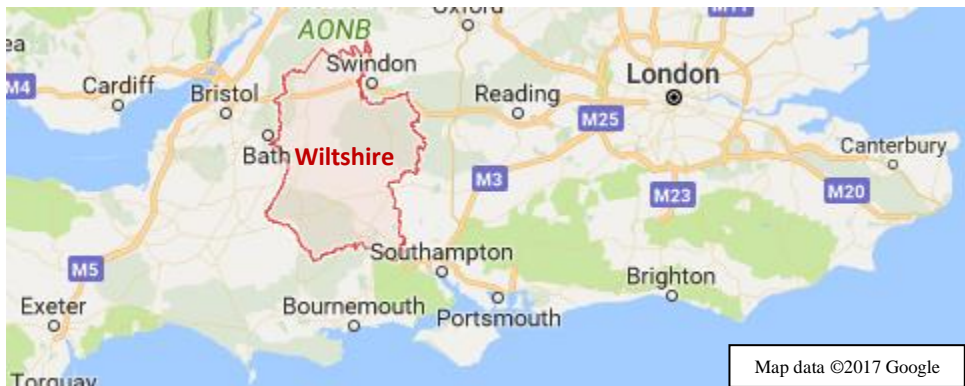
Map showing Wiltshire, England.